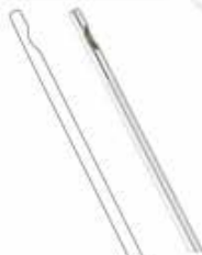
18-110 3 mm \varnothing 15 cm one central hole