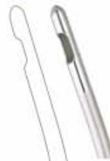
18-111 6 mm \varnothing 15 cm one central hole