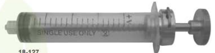
18-127 Fat Suction Syringe 20 ml