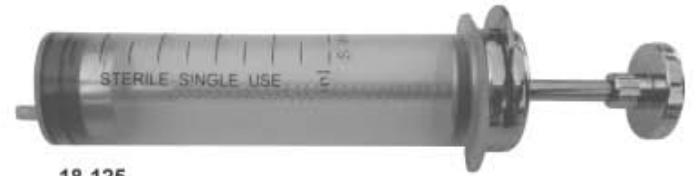
18-125 Fat Suction Syringe 50 ml