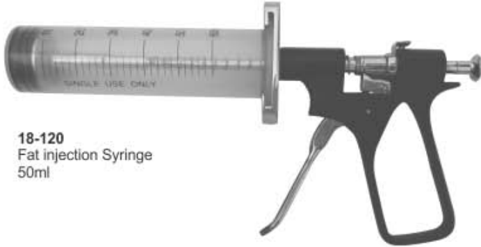
18-120 Fat injection Syringe 50ml