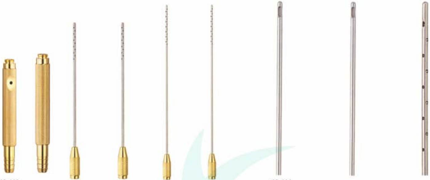
18-113 Liposuction Cannula Set for Abdomen and Saddlebag With Threaded Fitting Liposuction Cannula with threaded connector, 22-Holes, diameter 3.0 mm, working length 20cm Liposuction Cannula with threaded connector, 22-Holes, diameter 4.0 mm, working length 20cm Liposuction Cannula with threaded connector, 30-Holes, diameter 3.0 mm, working length 30cm Liposuction Cannula with threaded connector, 30-Holes, diameter 4.0 mm, working length 30cm Liposuction Cannula Handle Liposuction Cannula Handle with Interrupting Hole