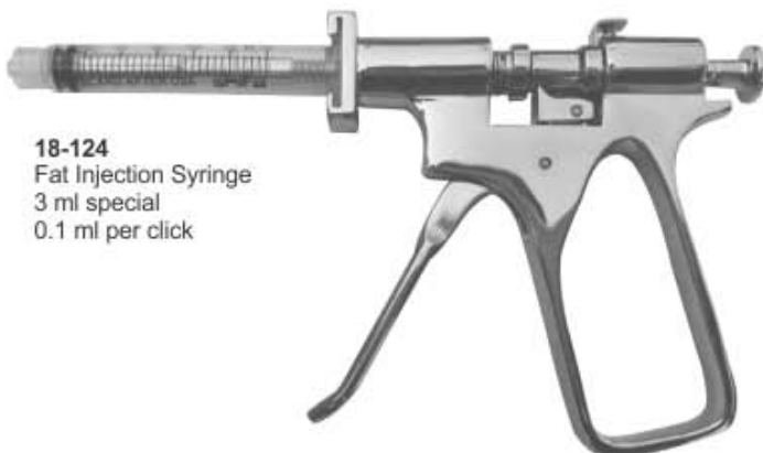
18-124 Fat Injection Syringe 3 ml special 0.1 ml per click