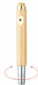
18-049 with rotatable tube connection Accessories