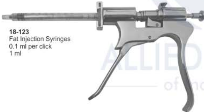
18-123 Fat Injection Syringes 0.1 ml per click 1 ml