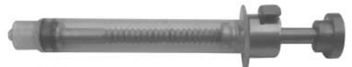
18-130 Fat Suction Syringe 3 ml