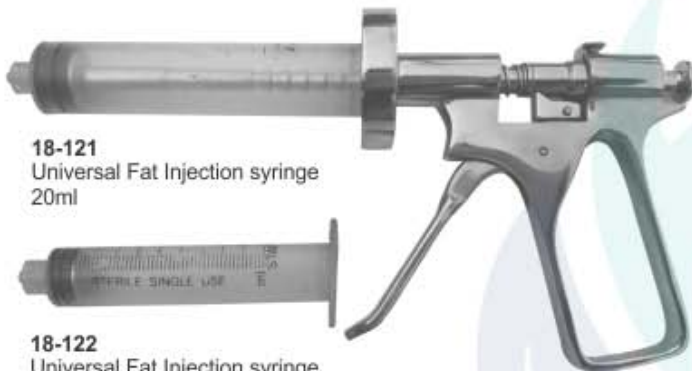
18-121 Universal Fat Injection syringe 20ml