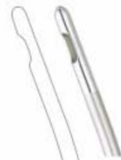
18-112 6 mm \varnothing 25 cm one central hole