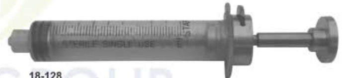
18-128 Fat Suction Syringe 10 ml